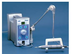
Suspension Handpiece Cradle (Option)

Optional handpiece cradle enables you to work while suspending the handpiece in the air. More space on the desk allows you more flexibility. Arm length is adjustable.